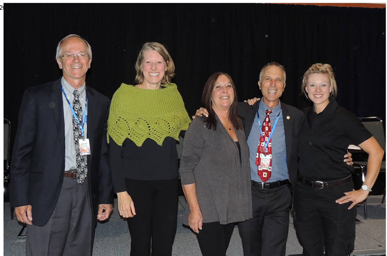
Skagit County's Opioid Workgroup Leadership Team created a plan to meet several goals: prevent opioid misuse, treat opioid dependence, expand access to medication assisted treatment and prevent deaths.